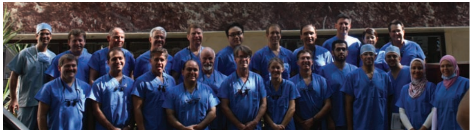
ALL SMILES: There are a whole bunch of docs and auxiliary staff in this photo...