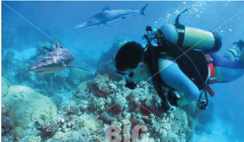
THE DEEP END: Enjoy some of the region's best diving during Spring Break 2010 in Roatan.

Couples enjoy Infinity Bay's privacy and luxury, while families revel in the spacious and comfortable accommodations. Infinity Bay offer a fun-filled Roatan vacation for those wanting to relax on a tranquil beach, for those